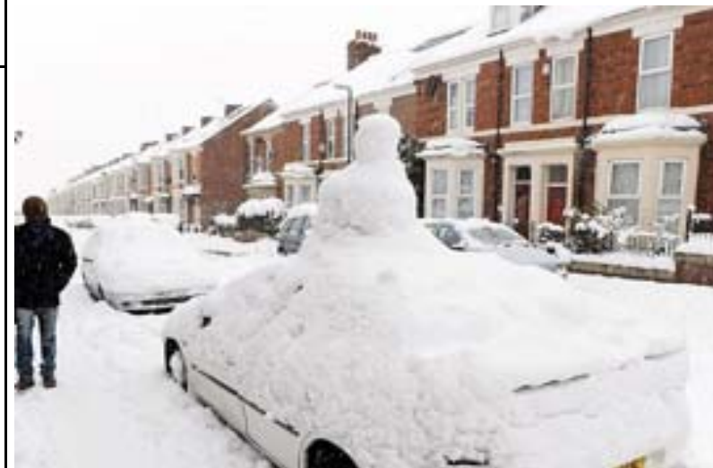
Snow deluges and white-out struck Newcastle 29th Nov

Britain & Ireland will be often dominated by high pressure over Scotland or to the North of Scotland connected either to High pressure over Scandinavia or (probably less often) Arctic/Greenland while active low pressures dominate South Europe / Biscay and also attack From the West at times but are largely blocked and take a local Jet Stream South path.