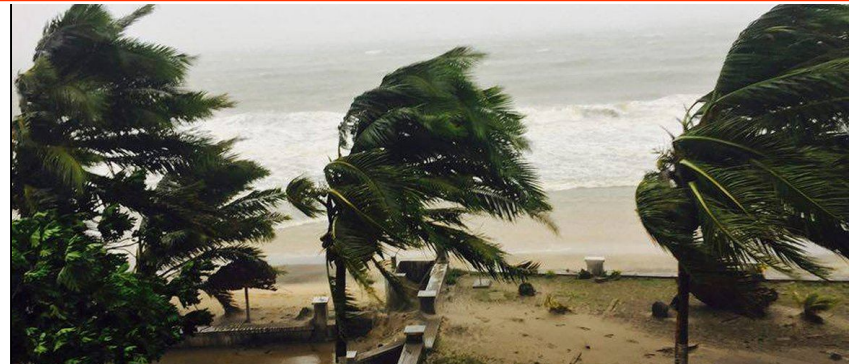
Tropical Cyclone #Enawo has killed 3 people and left several hundred homeless in Madagascar: http://wxch.nl/2mCi3L