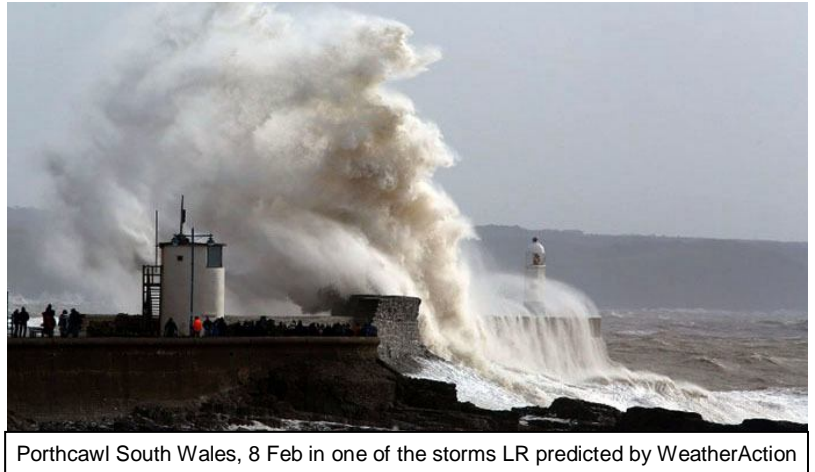
Porthcawl South Wales, 8 Feb in one of the storms LR predicted by WeatherAction

The assumption by the publishers is that the public and politicians and journalists of limited diligence and logical powers will be overwhelmed by the barrage of graphs and description which they will not read and simply accept the OPINIONS which do not in fact follow from the report content. They might just as well have presented a telephone directory as evidence for their delusions.