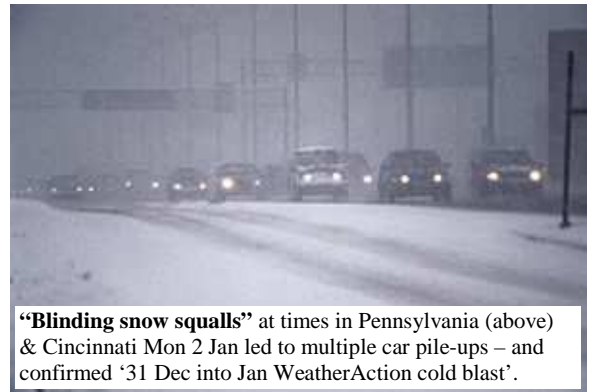
“Blinding snow squalls” at times in Pennsylvania (above) & Cincinnati Mon 2 Jan led to multiple car pile-ups – and confirmed ‘31 Dec into Jan WeatherAction cold blast’.

Further details of the USA events were also well described in the WeatherAction USA monthly maps forecasts and related Earthquake trials were also successful.