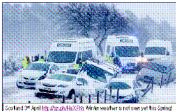
Scotland 9 th April http://www.dhbs.com Winter weather is not over yet this Spring!

The coldest or near coldest May for 100 years in Central and East parts with a record run of bitter Northerly winds. Snow at times especially on high ground in NE / East. Spring put in reverse.