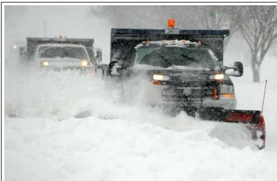
Trucks plow snow off the road during a blizzard in Alexandria, Virginia, just outside Washington DC, USA, 06 February 2010. The blizzard is expected to be one of the area's worst in recorded history and bring over two feet of snow, paralyzing transportation in the nation's capitol. http://www.monstersandcritics.com/news/usa/features/article_1531516.php/In-Pictures-USA-Blizzard#ixzz0f2xyaXUT and http://news.bbc.co.uk/1/hi/world/americas/8504221.stm

SWT Chain of cause revealed (+ animation) from Solar flares through ionosphere, stratosphere & jet stream to predicted world-wide extreme weather events: http://tinyurl.com/yb6mvlr