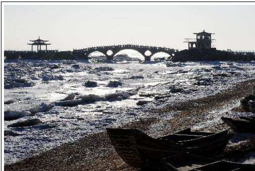
Photo taken on Jan. 22, 2010 shows the sea ice on the seashore in Xingcheng, northeast China's Liaoning Province. (Xinhua/Ren Yong). http://english.sina.com/china/p/2010/0123/301434.html . This confirms WeatherAction's warning issued 6 Jan for exceptional cold & icing at sea for NE China, SE Russia & Korea in this period. The jet-stream / polar region animation * shows the blast from the N pole which caused it – following solar flares & resulting disturbances in the ionosphere & stratosphere. *View via http://squall.sfsu.edu/crws/jetstream.html NH and see 'Comments from Piers info box on www.weatheraction.com home page for advice on loading and http://tinyurl.com/yat5dw7 (=WA10NewsNo7) for more discussion.

“The TOP SWIP 18-20 Jan was predicted to be the most significant of three SWIPS in the 16-27 th Jan prolonged world red warning period for extreme weather events on 4 continents”, said Piers Corbyn of WeatherAction long range forecasters; “- and the specific groups of events predicted for it all occurred: