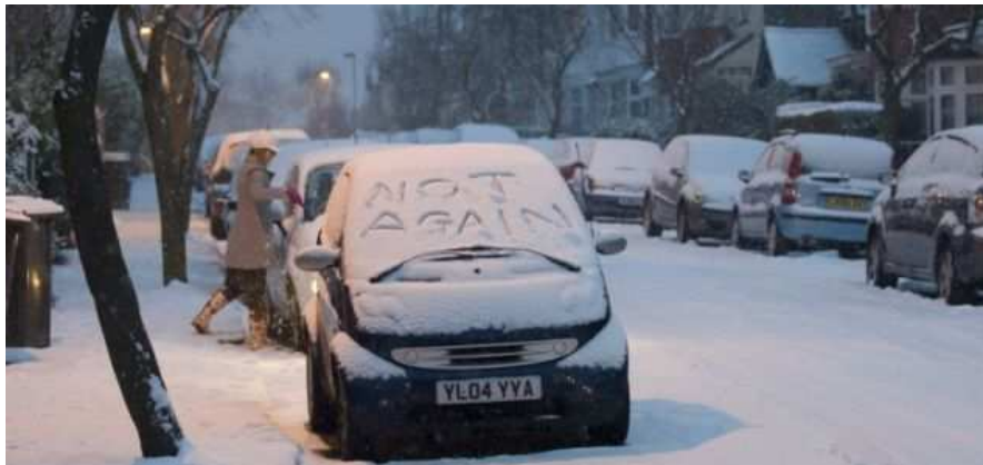
Snow hits London AGAIN (read windscreen!) 12/13 Jan, causing disruption to trains & roads. Snow heavier than MetOffice expected but in line with WeatherAction long range detailed warning for extra activity and drifting snow 11-13 th http://tinyurl.com/ycmfhw

• Mild, wet windy weather to sweep Brit & Ireland last week Jan - as forecast