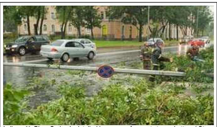
In line with Piers Corbyn's detailed long range forecast storms battered St Petersburg Sunday 15<sup>th</sup> Aug before moving towards Moscow as the jet stream changed as predicted. In Pakistan there were also extra deluges then marked abatement of rain as weather patterns changed as predicted.