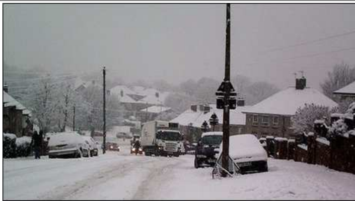
Lack of Road salting is causing accidents & deaths pic http://tinyurl.com/ko4kk5 (5Jan) WeatherAction warned icy snowy weather will continue with few breaks through Jan & Feb See http://tinyurl.com/yal4967

It's not a cold SNAP - It will go ON & ON