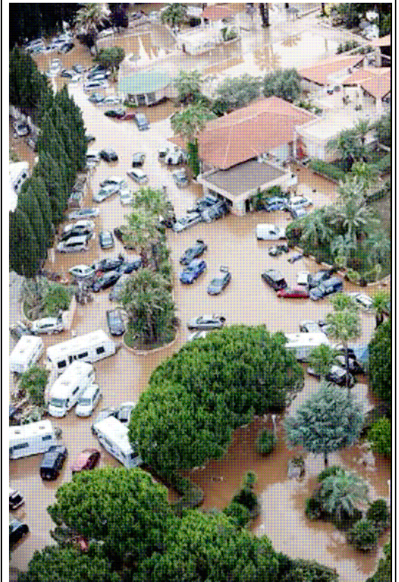
The worst floods in France – Cote D'Azur - for centuries killed 25 when 14inches of rain fell in a few hours on 14 June http://bit.ly/bj461J http://bit.ly/dmKLyj , http://bit.ly/abCxqv , http://bit.ly/a7zZ6G