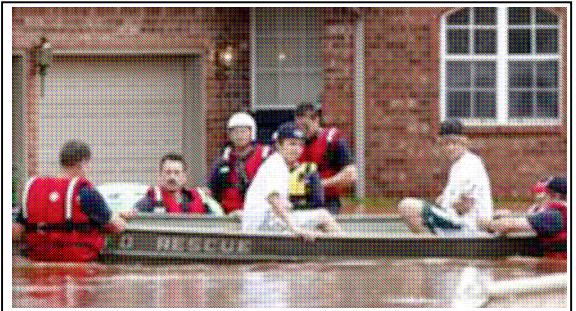
Record Floods inundated Oklahoma City 14 June. http://bit.ly/aQfaBn - just after Record floods drowned 20 in Arkansas 10 June http://bit.ly/9BUndI

flares Jun 12 & 13. The major, sudden solar events which caused the weather extremes are on NOAA links: http://bit.ly/9SAOFp , http://bit.ly/cm0ORK including 'sounds' of radio storms!