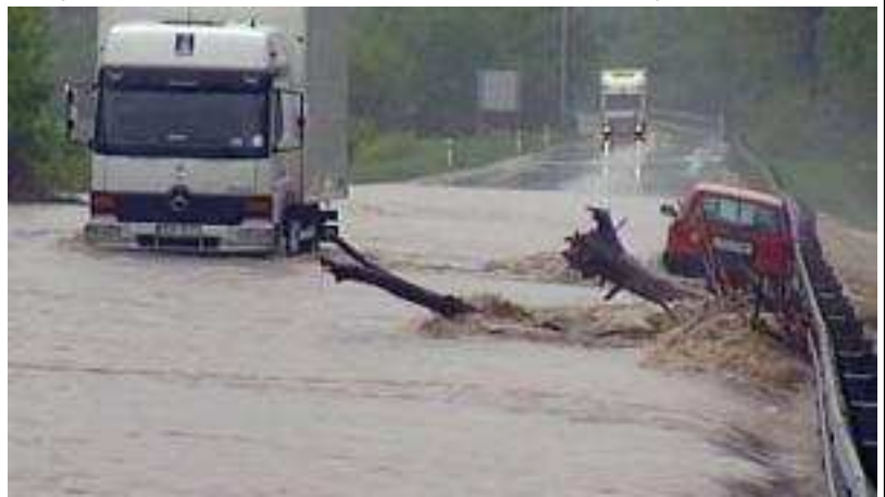
Simultaneous massive floods hit Germany, Poland & many parts Europe killing at least 9 http://bit.ly/9IULQC , http://bit.ly/a4Uthw & confirming WA LR forecast.