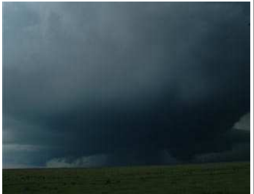
Awesome storms + tornadoes Texas 19/20 May confirmed WA long range forecast for South USA.