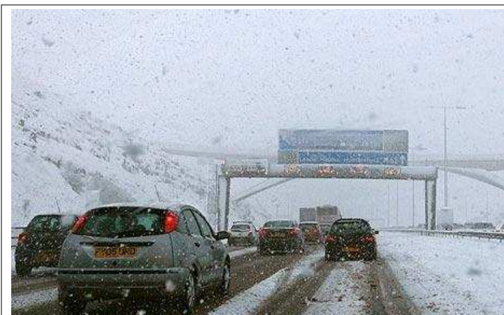
Blizzards on 2 nd Jan 2010 on the M62 motorway near Ripponden, W Yorks, England Photo GETT Telegraph. Meanwhile 30 people are stranded in Yorkshire Dales for 2 days – (BBC video) http://tinyurl.com/yigy3b7 . Both confirm WeatherAction's long range warning of blizzards espec in North/East 1 st -3 rd Jan.