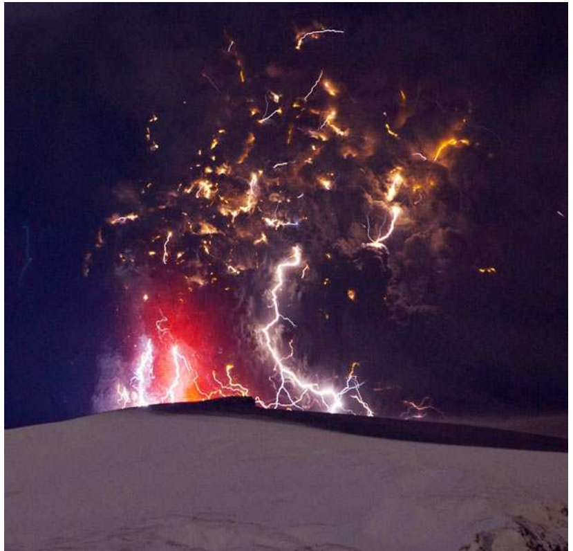
Fantastic lighting displays by volcano Ayah-Fyah-Plahyer-Kuh-Dool (our own pronunciation!)

http://www.telegraph.co.uk/earth/earthpicturegalleries/7606679/Iceland-volcano-the-latest-spectacular-pictures-of-the-volcanic-eruption.html?image=1