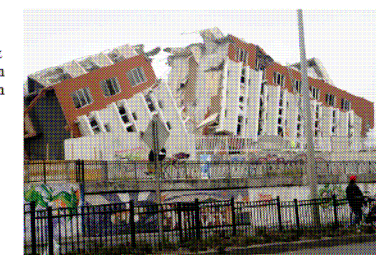
The Gigantic Chile Earthquake (M=8.8) offshore Maule Chile Feb 27 (day after M=7.0 Ryukyu Japan quake) struck in a special Weather Action “Sharp Alpha SWIP” & very close to full Moon Feb 28.