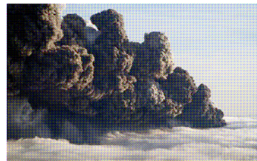
South Iceland’s Eyjafjallajökull (ay-yah-FYAH-plah-yer-kub-duh) volcano eruption 14 th April - New Moon, spewing ash over Europe.

“The EXTREME WEATHER event impacts first predicted on April 4 have already been further spelt-out after the CME which took place April 13 http://bit.ly/cZRLNH . We have a number of trial enhanced risk periods for more quakes (Q-SLIPs) to come but after 18-24 April another especially significant major Q-SLIP is probably 18-21 May.