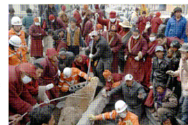
The Major Earthquake (M= 6.9) which hit Qinghai Province NW China 13 th April near New Moon also coincided with a major Coronal Mass Ejection the main impact of which – (USA NOAA) will start 18-19 April – a WeatherAction long predicted Red Weather Warning & Major Solar Weather Impact Period (SWIP): http://bit.ly/cZRLNH