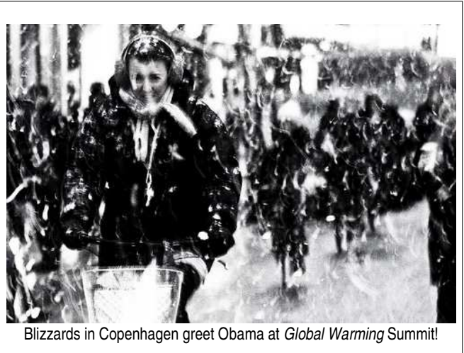
Blizzards in Copenhagen greet Obama at Global Warming Summit!

• Carbon Trading & all CO2 reduction schemes must stop.