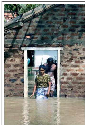
Two of the 58,000 made homeless in Sri Lanka by floods from storms specifically forecast by Weather Action for Sri Lanka 17-19 th Nov.

If a deal is signed in Copenhagen the development of Sri-Lanka and many countries will be held back and these people will be locked in poverty for life.