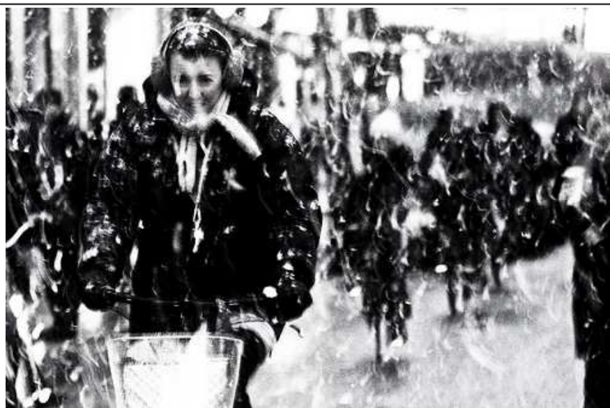
Copenhagen as the Global WARMING junket greets Obama